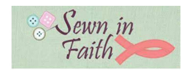
~ Sewn in Faith - Through the Eye of a Needle ~

Once upon a time, there was a lady (let's call her Elzora) who had her heart set on helping others through her talent with the sewing machine. Elzora kept her fingers nimble sewing dresses, wedding dresses, replacing zippers, and sewing clothes for her 4 children. Basically, there was no job too big for her to handle and she was always happy to help. (Yes, ladies – that includes the kitchen area). She was known far and wide and people loved what she did with needle and thread and her trustworthy sewing machine. One day God spoke to her saying 'Go forth and use your talent to make quilts for anyone who needs to stay warm and find comfort in the warmth of something to snuggle.' Elzora answered God's call and started sewing blankets and soon others wanted to help with her mission, so she started Elzora's Sewing Ladies at the Methodist Church (I don't know if that was the actual name, but I like it). Oh, the wonders of the beautiful blankets these ladies made. After making hundreds, if not thousands, of blankets, Elzora laid down her head one day, her tired hands wanted to be with her Lord. I can see her sewing angel wings in her new home with God and singing His praises. Blessed be the memory of my Aunt Elzora. Return next month for more Through the Eye of a Needle.